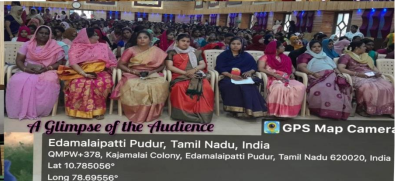
A Glimpse of the Audience